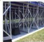
The new bleachers will be set on pilings for stability and be wheelchair accessible.