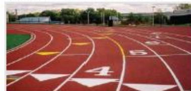
The synthetic, 400 meter oval will accommodate 2 additional lanes.

The GFAA is a nonprofit 501(c)3 community-based organization dedicated to the principle that all of Gloucester's children should be able to participate in the sport of their choice, regardless of financial circumstances. Equally important is our belief that the students-athletes should be able to practice and play on safe and maintained facilities.