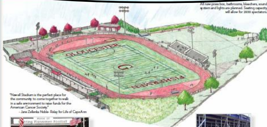
All new press box, bathrooms, bleachers, sound system and lights are planned. Seating capacity will allow for 2000 spectators.

"Newell Stadium is the perfect place for the community to come together to walk in a safe environment to raise funds for the American Cancer Society."