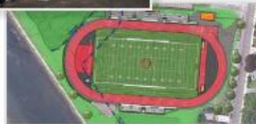
The main playing field will be wide enough to allow for MIAA compliance for soccer, field hockey and lacrosse games. The substituted track will increase the number of lanes to 8. Practice fields are also included in the project.