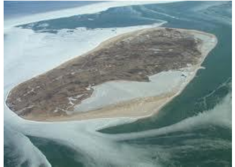
Nantucket Land Council, Muskeget Island