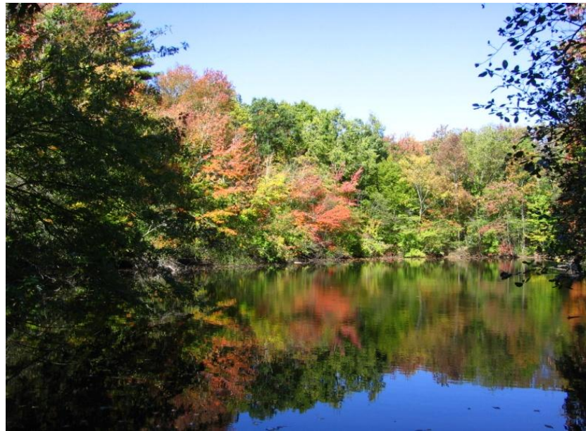
Shrine of Our Lady of LaSalette, Attleboro