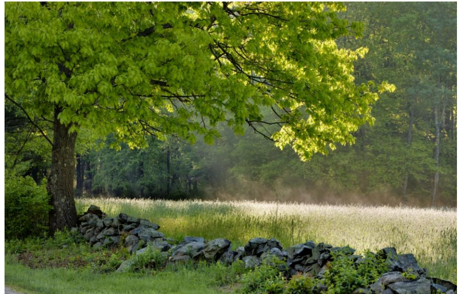
Windrush Farm, North Andover