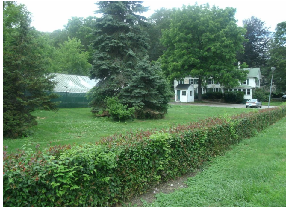
Whispering Hill Woods, Woburn