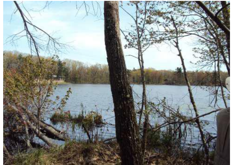
Muir Meadows, Worcester DPWP