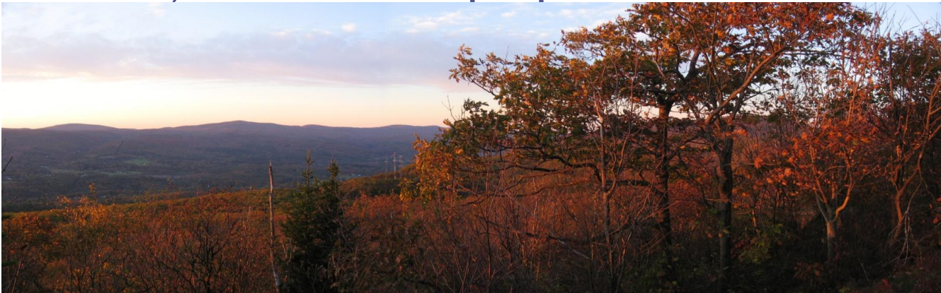
Berkshire Natural Resources Council, Hoosac Range/Caffrey