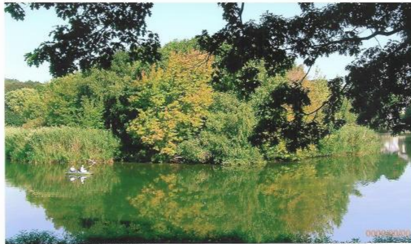
Arlington Land Trust, Elizabeth Island