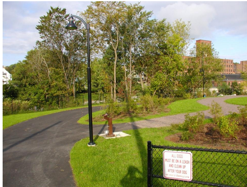
Community Path, Somerville