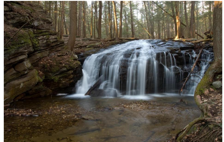
Holland Glen Forest, Belchertown