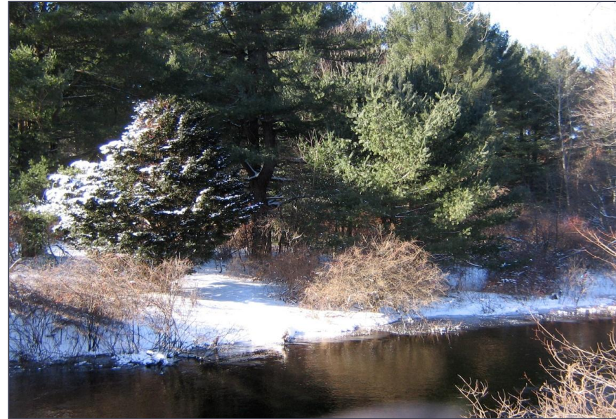
Dudley Conservation Land Trust, Leovitch Landing, Oxford