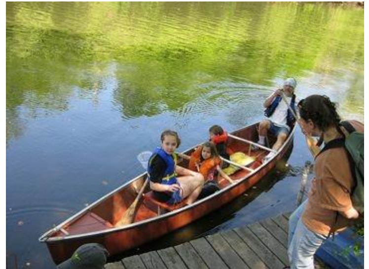
Broad Meadow Brook, Worcester