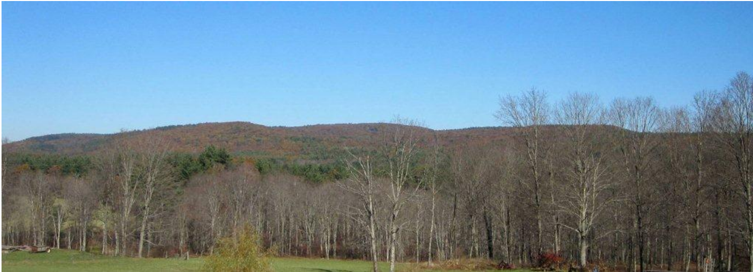
Brushy Mountain, Leverett & Shutesbury