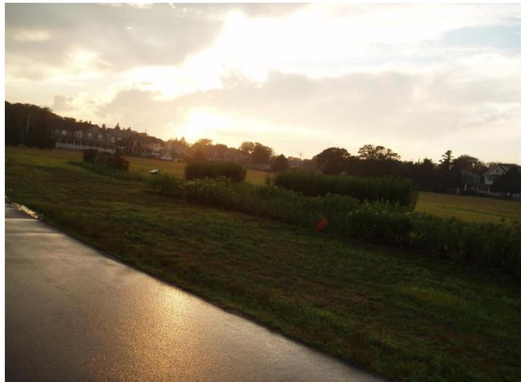
Oak Bluffs, Sea View Park