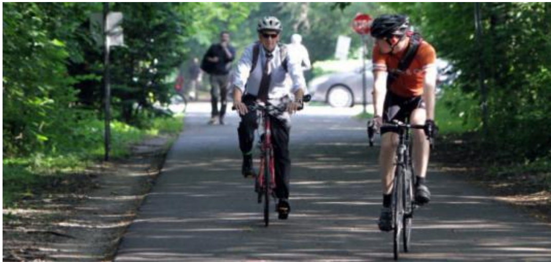
Minuteman Bikeway, Arlington