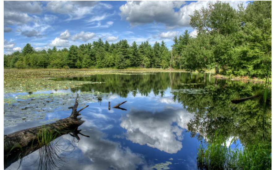
Sibley/Warner Farm, Spencer