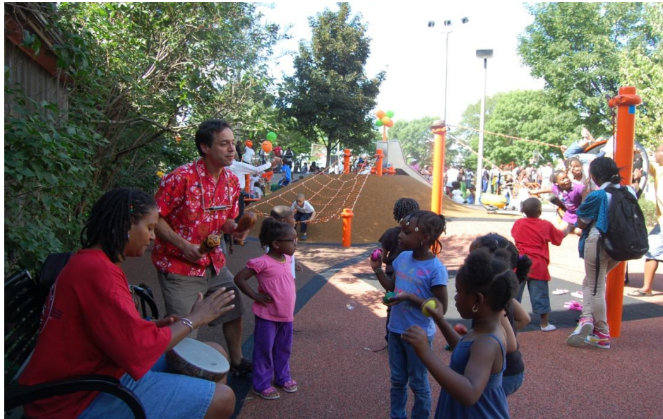
Jeep Jones Park, Boston