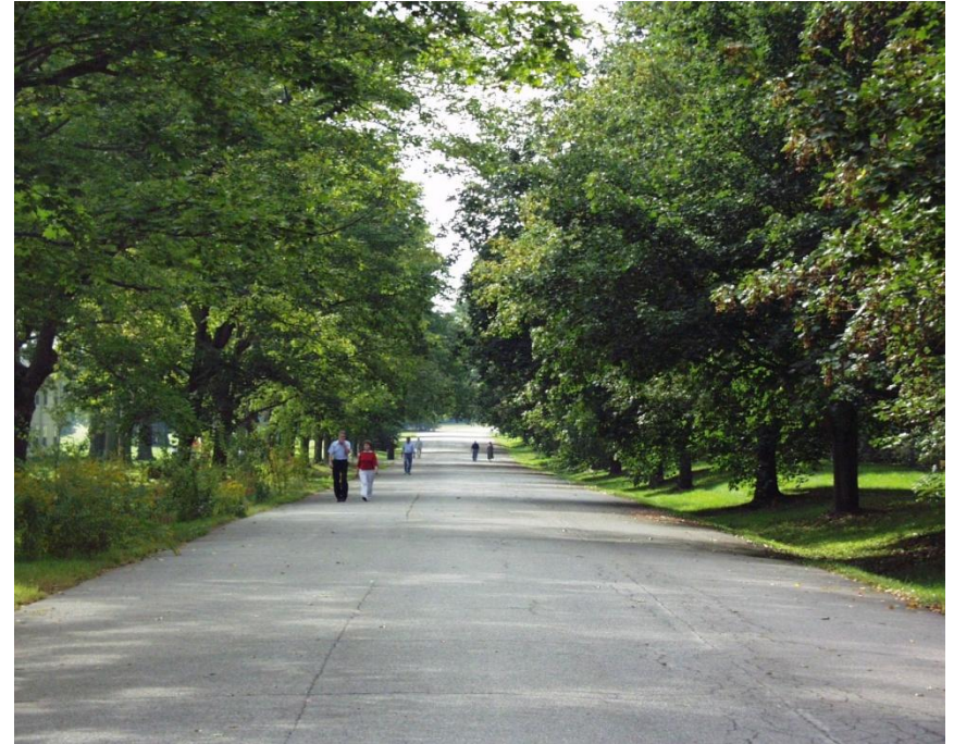
Cushing Park, Framingham