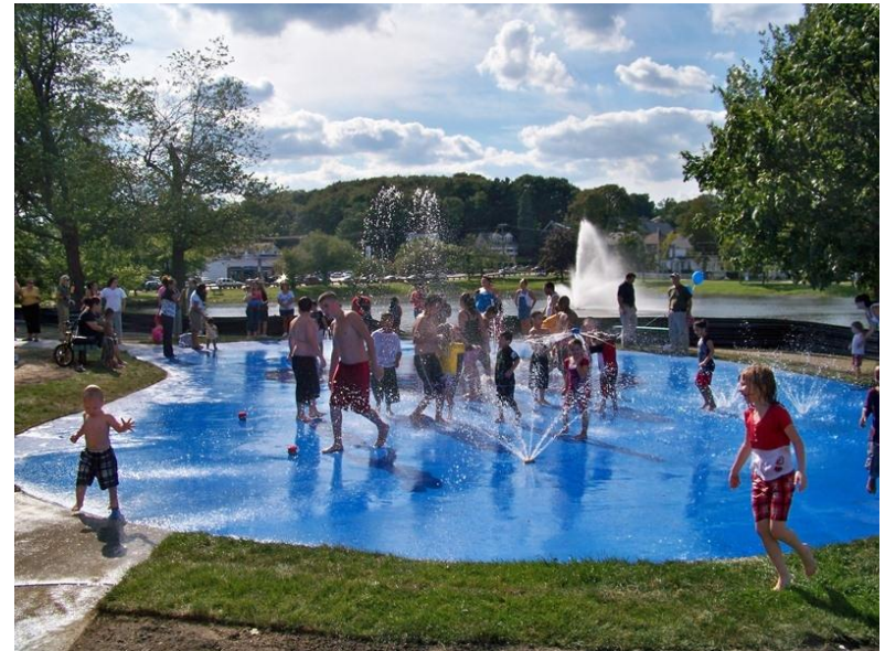
Flax Pond Park, Lynn